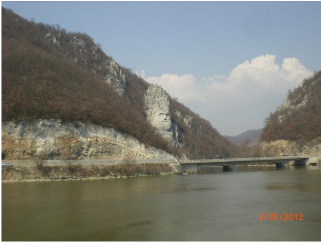
Cruising the Danube – Notice Man on the Mountain