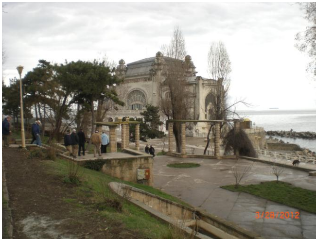
Casino in Constanta, Romania on the Black Sea