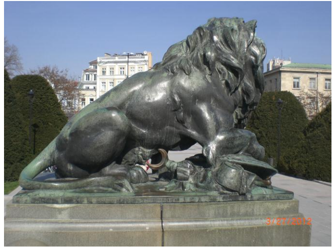
Breaking the Ottoman Rule – Notice the Islamic Crescent in the trash heap.