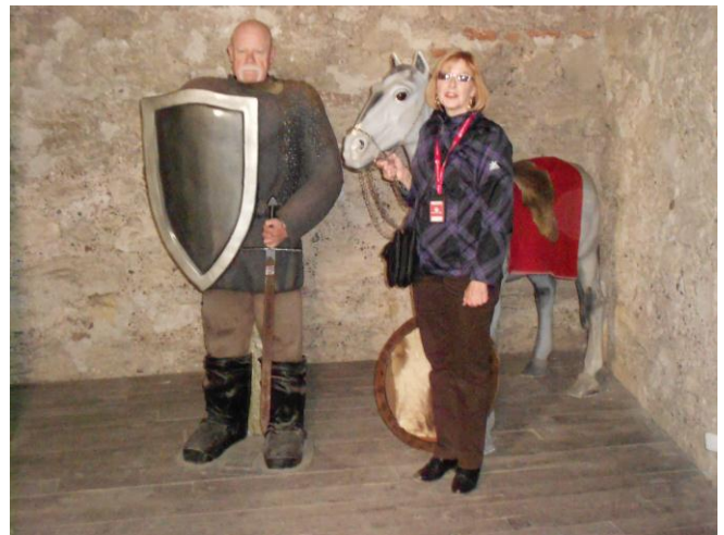
Your editor ready to do battle